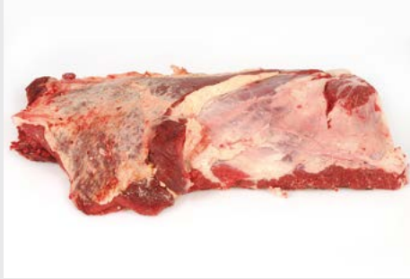
9. Boneless Neck and Chuck Eye.